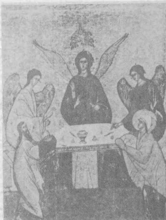
"Old Testament Trinity" from the Novgorod Quadripartite icon (fourteenth–fifteenth centuries). From V. N. Lazarev, Novgorodskaja ikonopis' (Moscow: Iskusstvo, 1976), plate 34.

among those being resurrected from the dead, as popular religious poetry of the time suggested. On the other hand, for Rublev and for people of his circle, the crudeness, the wild fanaticism in the icons of peasant masters alienated them. In fact, most icons which then existed in Rus', especially icons which were deeply revered, were not Rublev-like in character or spirit.