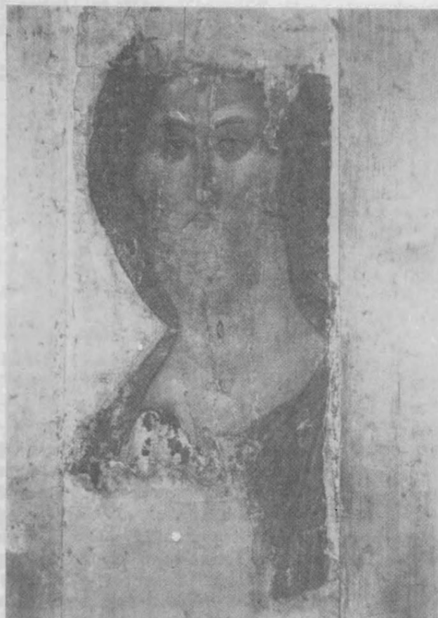
"Savior" icon by Andrei Rublev (1410–20). From V. N. Lazarev, Moskovskaia shkola ikonopisi (Moscow: Iskusstvo, 1980), plate 31. Reprinted courtesy of Iskusstvo Publishers.

In order to determine the historical place of Rublev one must remember that his younger contemporary was Jan van Eyck, that the "Trinity" of Rublev is also a masterpiece, like the remarkable Ghent altarpiece, "Adoration of the Lamb," done somewhat later. The Dutch masterpiece wins one over most of all by its broad scope of the real world, by its loving appreciation and reproduction of the smallest details in combination with the deep symbolic sense of the whole. The masterpiece of Rublev, on the contrary, conquers one by its ability to express much in a small, laconic allegory embracing the whole world. This attests to Rublev's attachment to ancient tradition. . . .