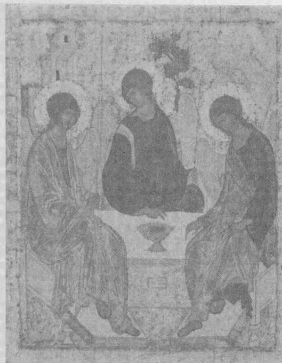
"Old Testament Trinity" icon by Andrei Rublev (ca. 1411).

The icons and frescoes of Rublev were intended to beautify churches. The themes of his painting are borrowed from Scripture, and in that way silently took part in the Orthodox liturgy. Of course, Rublev served his art because he believed deeply, and this faith overflowed from him, and inspired him in his creative